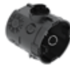
Flush-mounted device box 66 Item no. 2003702