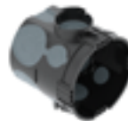
Flush-mounted device box 66, airtight Item no. 2003708