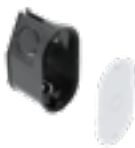
Flush-mounted outlet box Item no. 2003732